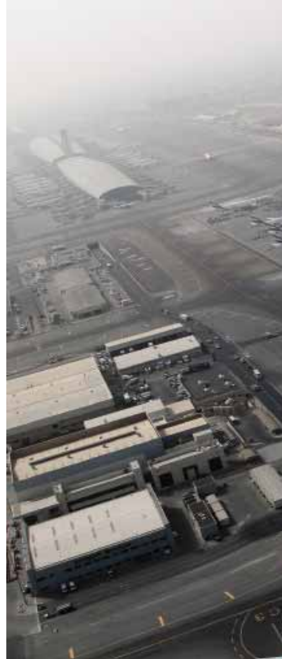
A bird's-eye view of Dubai International Airport.